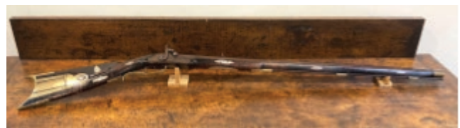
Fig. 6 David Leonard, (1859 Rifle) Overall Early Style Architecture