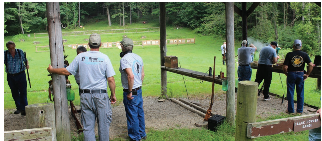
“Waiting for results” at the shooting range, AOLRC Picnic, Ashland Wildlife Conservation League, Ashland County. Shooters include AOLRC members and members of the New Frontiersmen Muzzleloading Club.