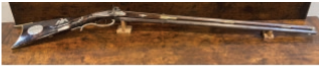
Fig. 8 David Leonard, (1870 Rifle #1) Overall later Style Architecture