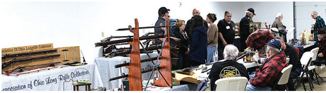
Some of the 40+ display tables at the November 2025 AOLRC buy, sell, trade show in Hilliard, Ohio.