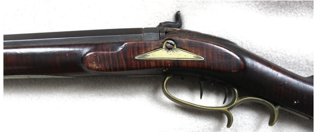
Side plate and unique breech of J.W. Vanmeter rifle.