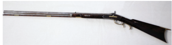
Gracile half stock, cheek piece side, by Caleb Vincent, Washington Co.