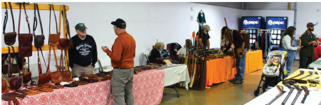
All sorts of antique muzzleloaders and accoutrements at the November 2025 AOLRC buy, sell, trade show in Hilliard, Ohio.