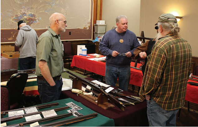
Members conversing over rifle displays at Marietta Show, Spring 2025.