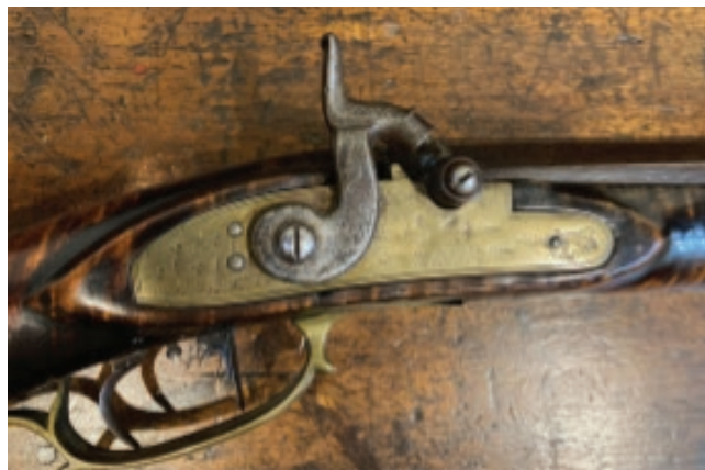
Fig. 3 David Leonard, (1855 Rifle #1) Wood contour follows the front of the lock, with a screw in Breech Drum