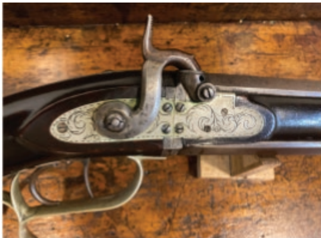
Fig. 11 David Leonard, (1870 Rifle #2) With a unique Snail design (Not seen in earlier pictures)

In contrast, Leonard rifles made between approximately 1870 and 1900 exhibit very different features. These later rifles do not have full patch boxes, instead use small cap boxes. They also feature cheek rests on both sides, unique snail design, as used on the Carson/Leonard rifle and wood that does not follow the contour of the lock. (See Fig. 8-13)