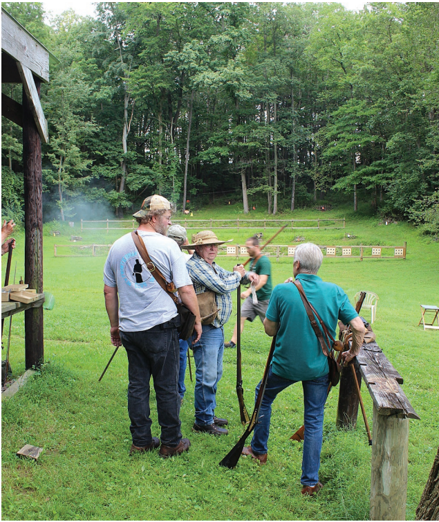
The “shooting match” at the August 2025, AOLRC Picnic, Ashland Wildlife Conservation League Ashland County. Shooters include AOLRC members and members of the new Frontiersmen Muzzleloading Club.