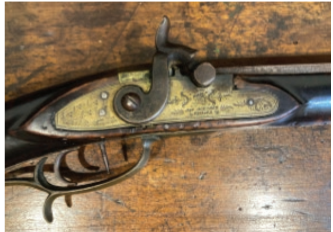
Fig. 5 David Leonard, (1855 Rifle #2) Wood contour follows the front of the lock, with a screw in Breech Drum

The earliest rifles in our collection, two dated 1855 and one dated 1859 share several distinct characteristics that are not shared with the Carson/ Leonard rifle. These rifles feature full patch boxes, screw-in nipple drums, single cheek rest and wood that wraps around the contour of the front of the lock. (See Fig. 2-7)