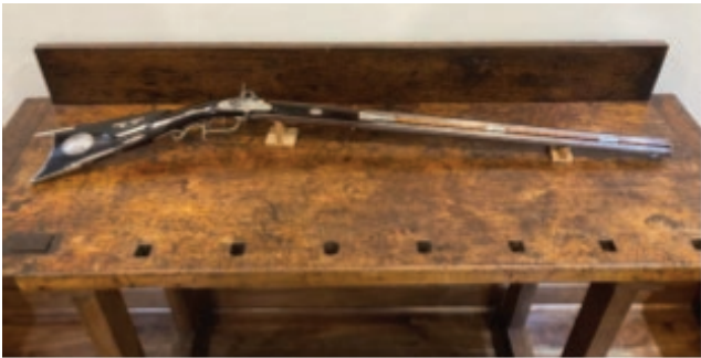
Fig. 10 David Leonard, (1870 Rifle #2) Overall later Style Architecture