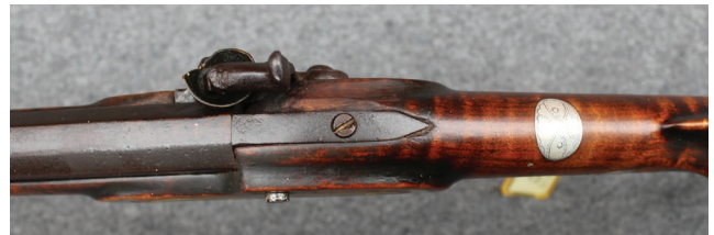
Tang, John Vincent rifle.