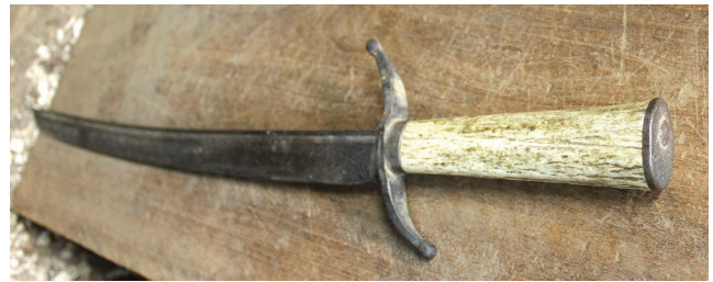
Detail of Aubhil re-purposed sword handle.