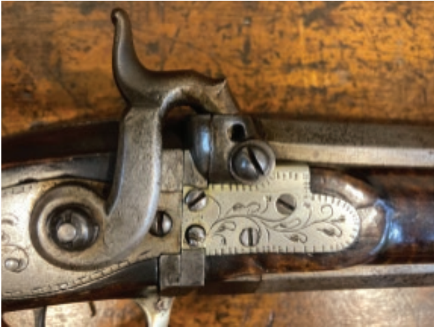
Fig. 9 David Leonard, (1870 Rifle #1) With a unique Snail design (Not seen in earlier pictures)