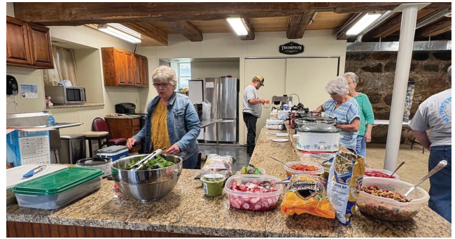
Crocks of delicious food at the August 2025, AOLRC Picnic, Ashland Wildlife Conservation League, Ashland County, Ohio.