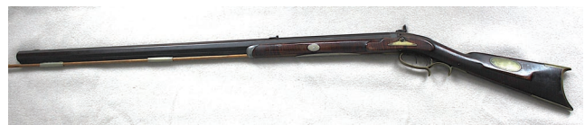
Full length J.W. Vanmeter rifle, side plate side.