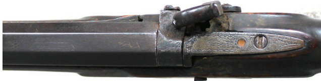
Note skirt around tang; "J.W. Vanmeter" discernible on barrel.