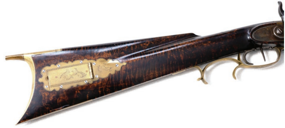
Detail of gracile half stock patch box by Caleb Vincent, Washington Co.