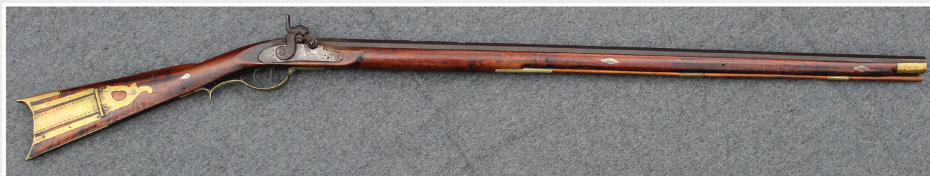
Unmarked “Slim” Pike County Sourced Rifle

Waverly, Pike County Provenance, unmarked. This slim or gracile percussion full stock rifle has a silver name plate inlet in the top of the barrel, but the signature is not present. Silver hunter’s star on very