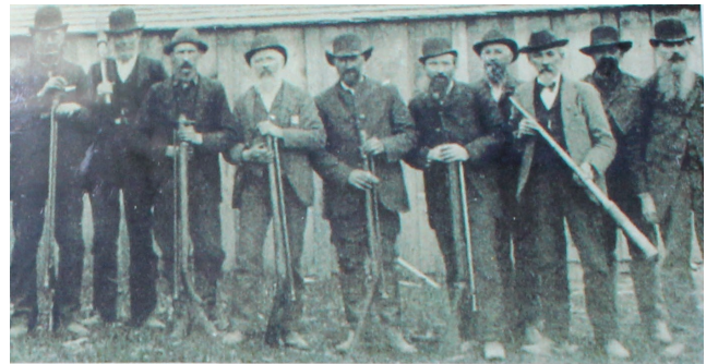
“Old timers” in a display at the August 2025, AOLRC Picnic, Ashland Wildlife Conservation League, Ashland County, Ohio.

One further random thought. When Ohio established its first muzzle loader deer season, they selected .38 caliber as the smallest size that could be used. I asked a few Game Wardens and conservation workers back then why a .38? The opinions ranged from “a desire to see original Ohio-made rifles used” to “virtually every Game Warden at that time carried a .38 Special handgun, and a quick field check of inserting a .38 Special cartridge into a muzzle loading rifle barrel would decide if it was over .38 caliber”. I never did get a definitive answer, but it might be a good topic around a campfire.