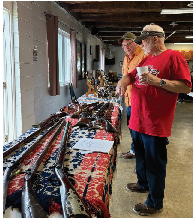
Display tables at August 2025, AOLRC Picnic, Ashland Wildlife Conservation League, Ashland County.