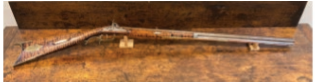
Fig. 12 David Leonard, (1900 Rifle) Overall later Architecture

In contrast, Leonard rifles made between approximately 1870 and 1900 exhibit very different features. These later rifles do not have full patch boxes, instead use small cap boxes. They also feature cheek rests on both sides, unique snail design, as used on the Carson/Leonard rifle and wood that does not follow the contour of the lock. (See Fig. 8-13)