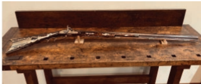
Fig. 2 David Leonard, (1855 Rifle #1) Overall Early Style Architecture

At this point, however, the story takes an interesting turn. After carefully studying Rock Island Auction’s sale catalog photographs, I began to question the timeline suggested by the presentation plate. I have