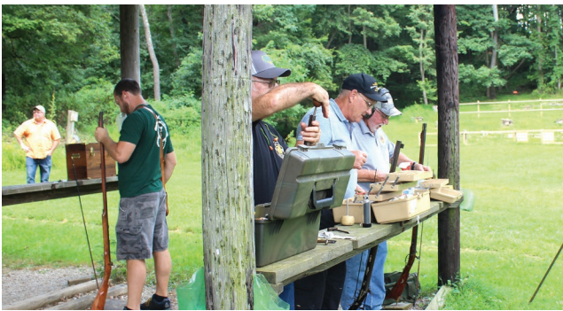
“Loading up” at the shooting range, AOLRC Picnic, Ashland Wildlife Conservation League, Ashland County. Shooters include AOLRC members and members of the New Frontiersmen Muzzleloading Club.