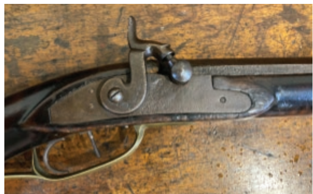
Fig. 7 David Leonard, (1859 Rifle) Wood contour follows the front of the lock, with a screw in Breech Drum