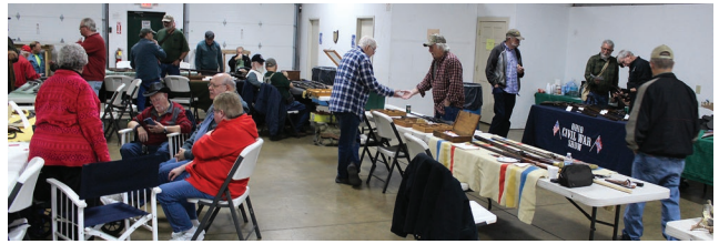
A lively scene at the November 2025 AOLRC buy, sell, trade show in Hilliard, Ohio.