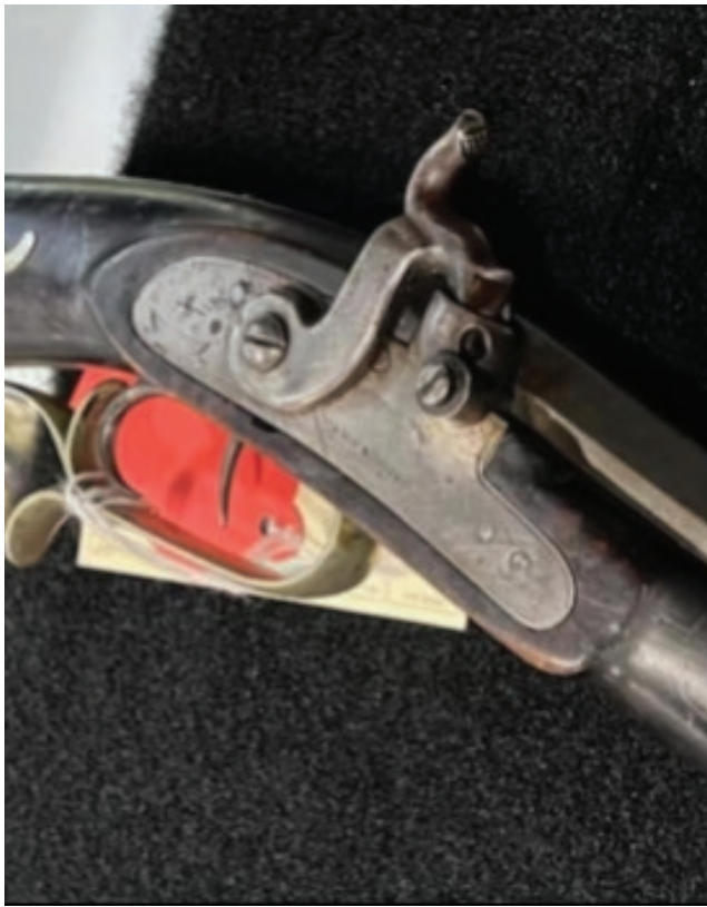
Fig. 15 Kit Carson/David Leonard Rifle, Consistant with the straight upward Wood contour and unique Snail design of the later guns

According to the inscription, the rifle was presented to Kit Carson on July 14, 1852—three years before the earliest dated Leonard rifles in our collection. Given the fact that the rifle’s features are from David Leonard’s 1870 through 1900 architectural styling, the timeline simply does appear to align.