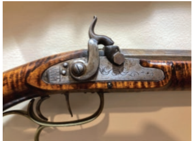
Fig. 13 David Leonard, (1900 Rifle) Wood contour turns straight upward with a unique Snail design (Not seen in earlier pictures)

The Kit Carson / Leonard rifle clearly fits the later category, consistent with rifles made between 1870 and 1900. This seems to create a significant problem with the stated presentation date of 1852. (See Fig. 14-15)