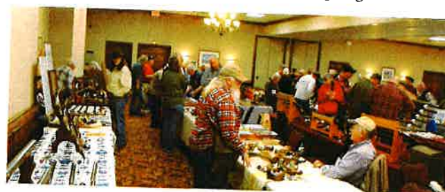
Members enjoying the show.