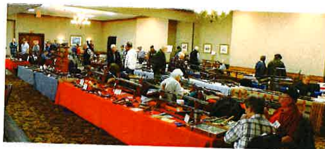
More exhibits and more members enjoying the show.