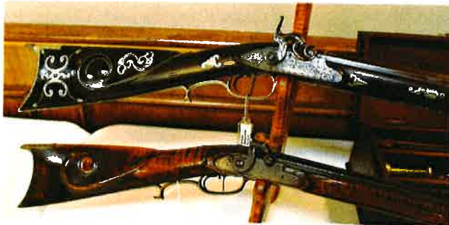
Close-up of two Bodenheimer rifles with artistic volutes; one plain and the other fancy.