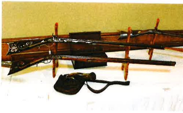
Long-barreled Bodenheimer rifle with back action lock and brass patch box.