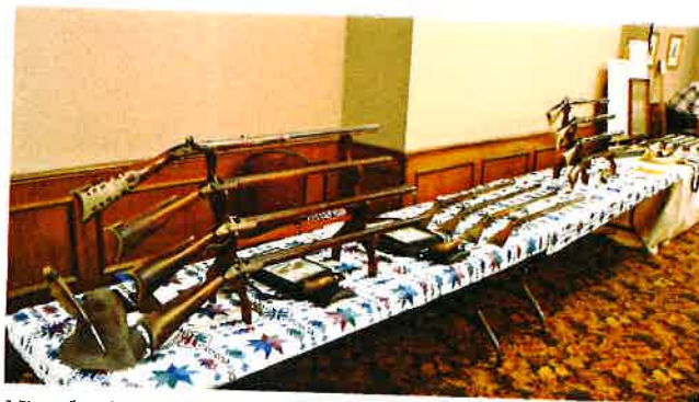
Nice display of Ohio rifles, Marietta Show, Spring 2023.