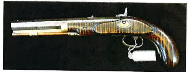
A rare percussion pistol by Bodenheimer, displayed at the Spring show.