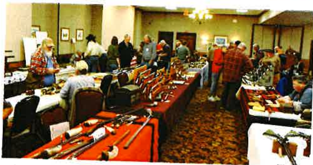
A hive of activity at the Marietta Show, Spring 2023.