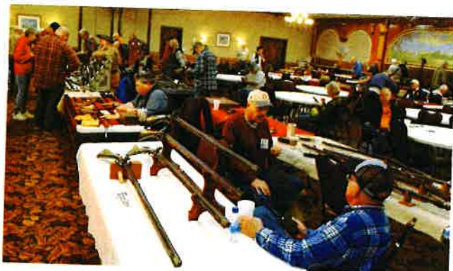
Members enjoying the show.