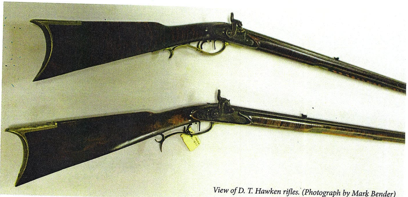
View of D. T. Hawken rifles.